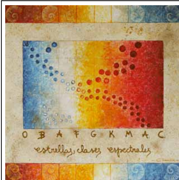
Mixed technique on canvas, 1 x 1 m STARS, SPECTRAL TYPES

Her last collaboration with CERN was in May 2016. She participated in an exhibition of "art@CMS" in Naples, where thirty artworks by international artists showed the discovery of the Higgs boson.