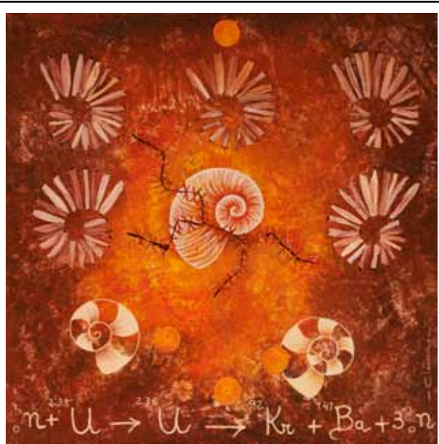
Mixed technique on canvas, 1 x 1 m NUCLEAR FISSION