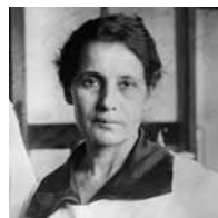
LISE MEITNER Physicist, Austria (1878-1968)