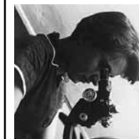
ROSALIND FRANKLIN Biochemist, UK (1920-1958)