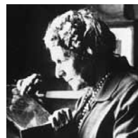
ANNIE CANNON Astronomer, USA (1863-1941)